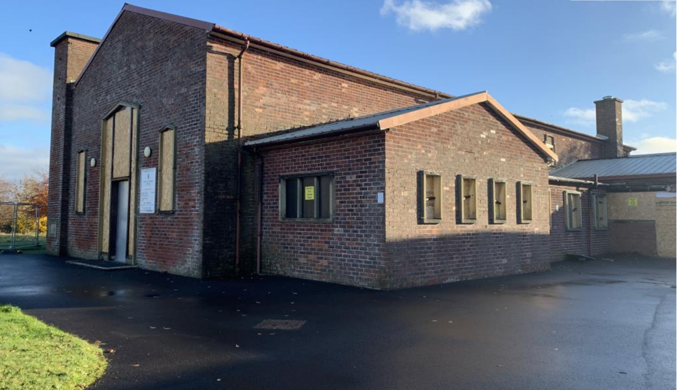
St John's Onthank Church, Hall & Manse, Wardneuk Drive, Kilmarnock, KA3 2EX