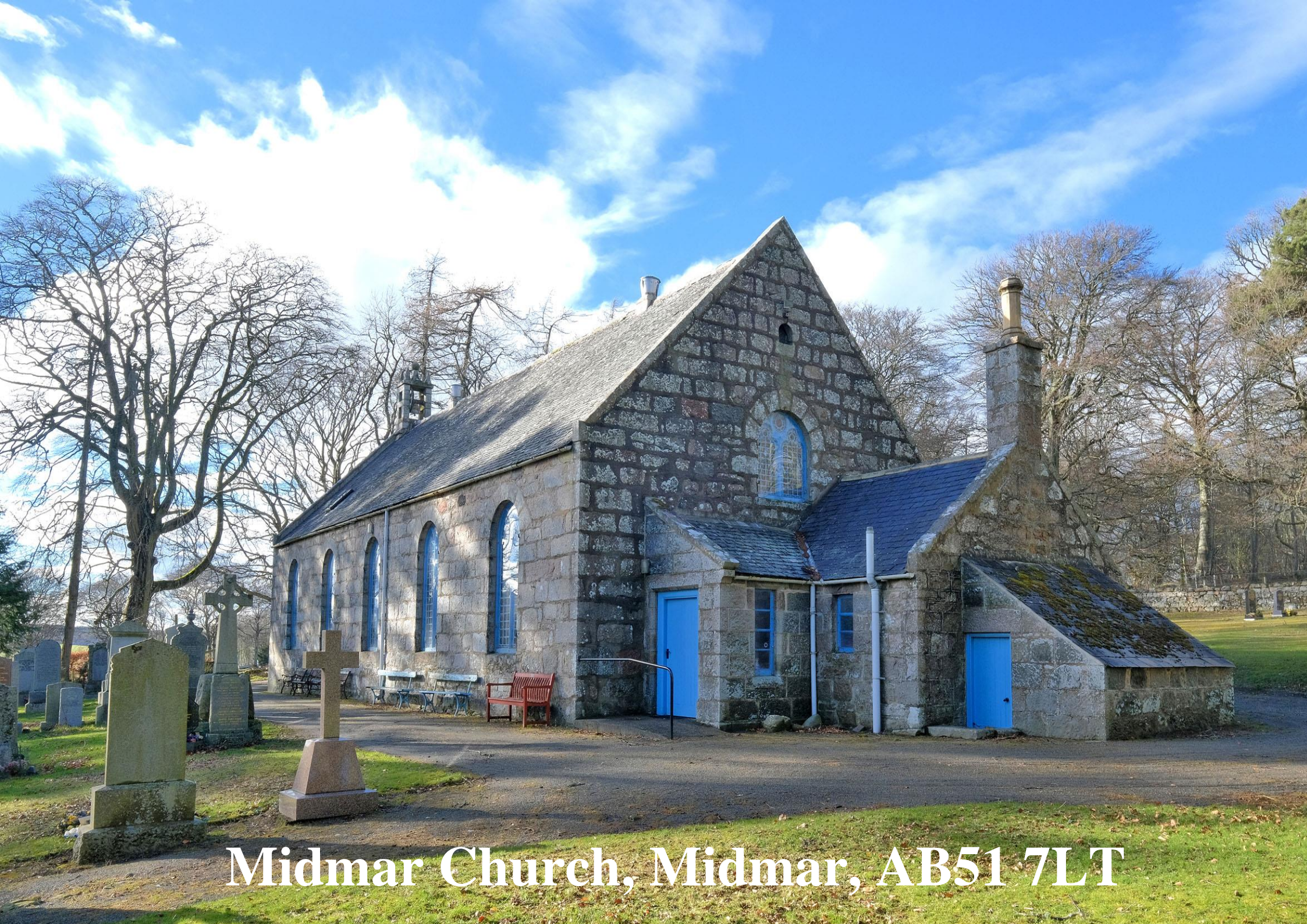
Midmar Church, Midmar, AB51 7LT