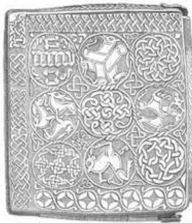
A picter of the auld leather kivver o THE BUIK O ARMAGH. Its Latin text o the letter tae Laodicaea, owerset abuin, is gien ablo.