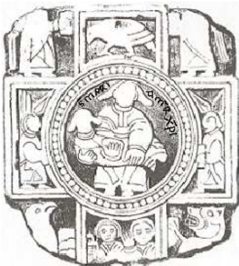
ninth century cross, Brechin, Scotland

Gin siclike fowk hedna chanced bein wrang, nane wad hae bin carvin crosses in India an Scotland baith mair nor a thousan year syne. For, gin Christ's for aa fowks, it's no eneuch tae be i the same kintra as fowk; ye maun líve i the samen warld. Sae some war intil the warld o stories, ithers the warld o carvin or fermin, pentin or bee-keepin, singin an monie mair. They chanced it, an foun the Spírit o God in aa thir warlds, an sae eenou the Kirk's in aa the warld. An tae God be the glore.