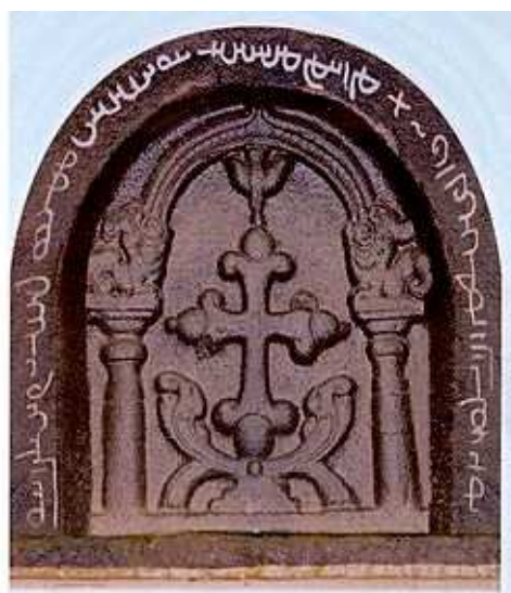
ninth century cross, Chennai, India