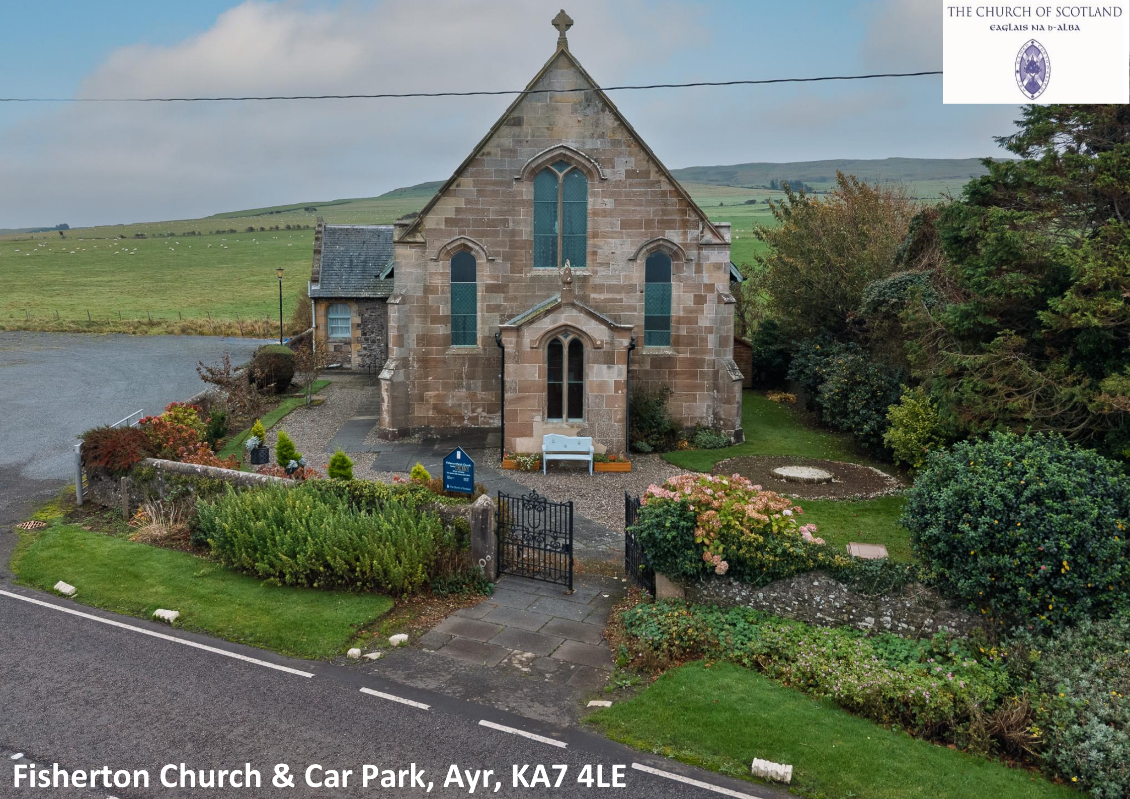
Fisherton Church & Car Park, Ayr, KA7 4LE