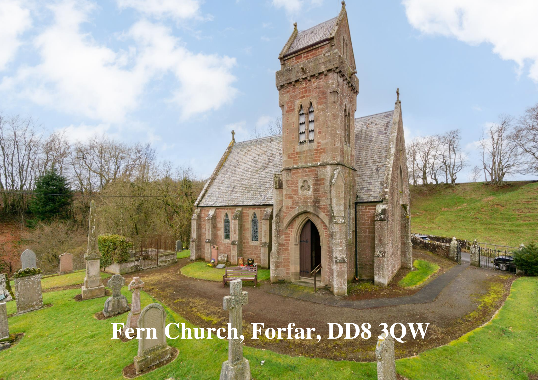
Fern Church, Forfar, DD8 3QW