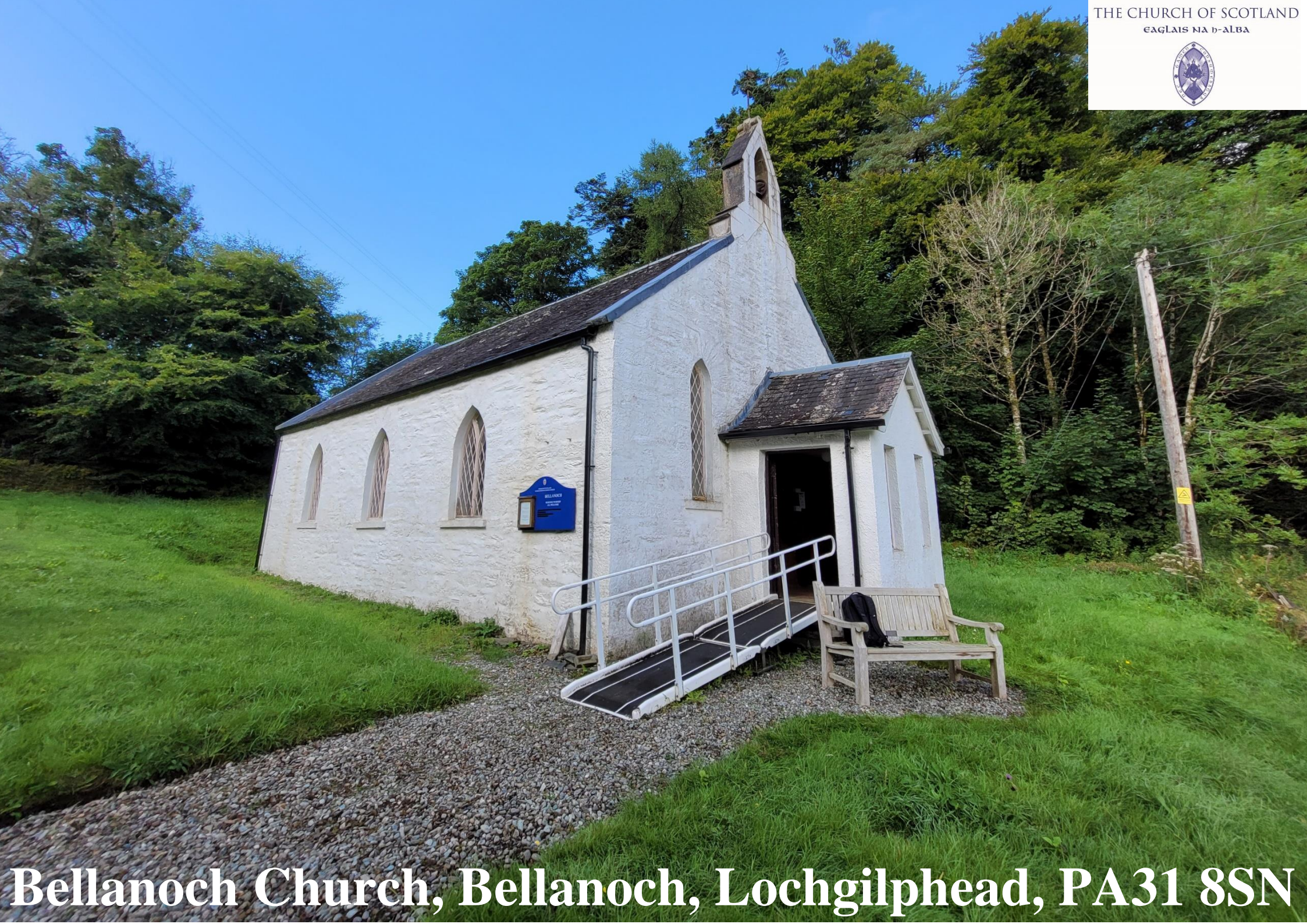
Bellanoch Church, Bellanoch, Lochgilphead, PA31 8SN