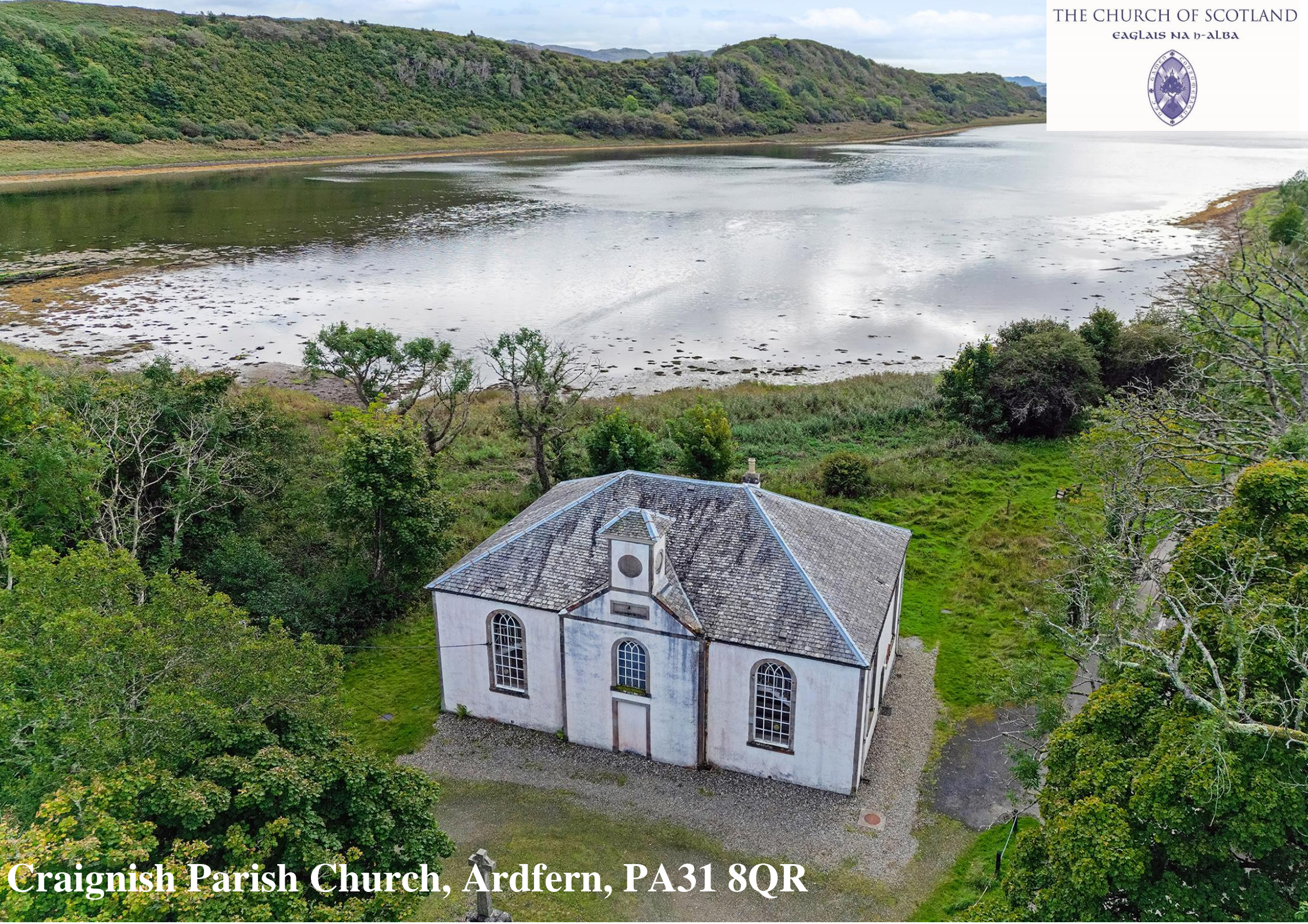
Craignish Parish Church, Ardfern, PA31 8QR