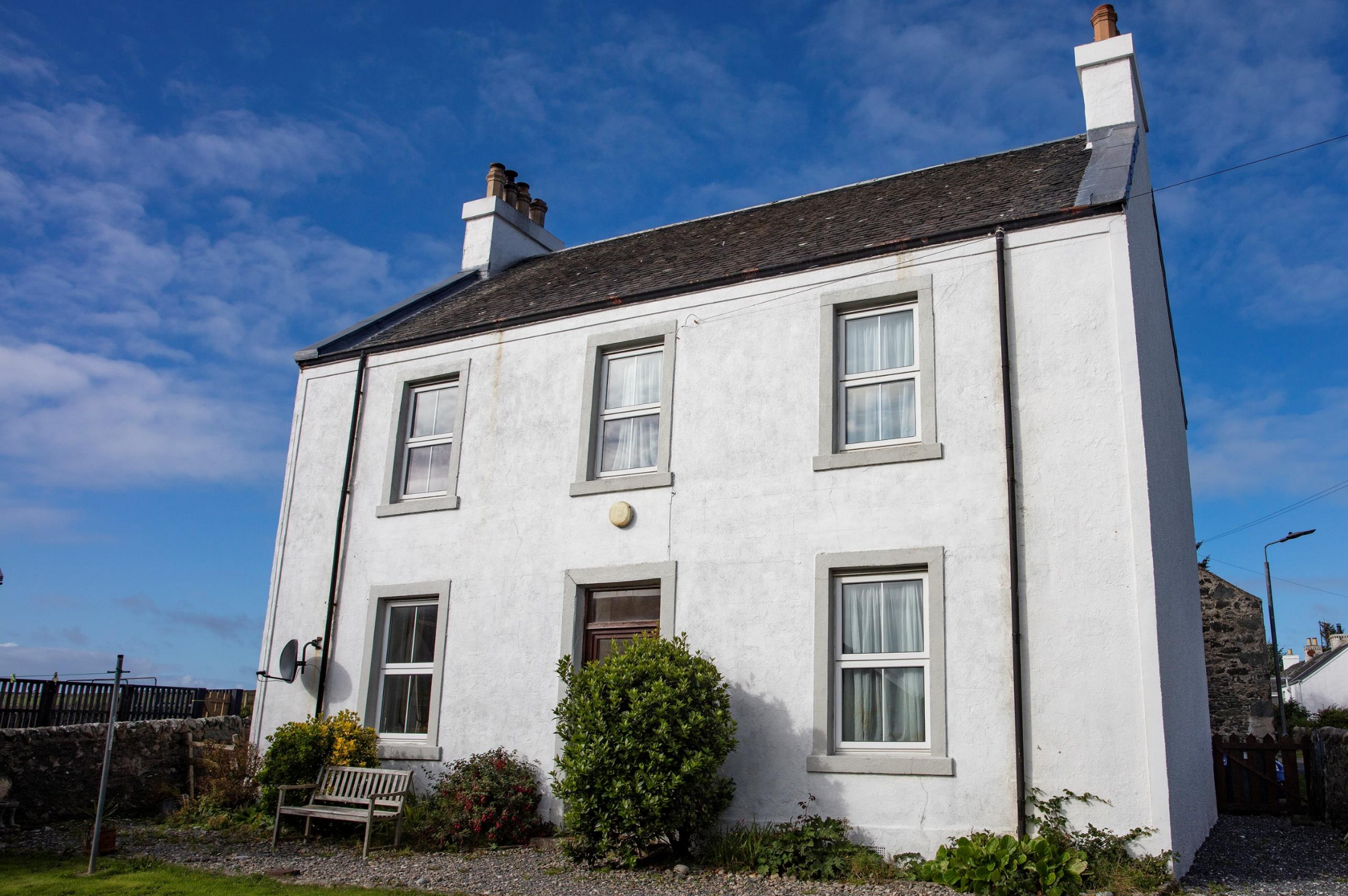
The Manse, School Street, Port Charlotte, Isle of Islay, PA48 7TW