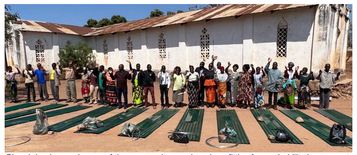
Church leaders and some of the community members benefitting from rehabilitation support

The CCAP General Assembly has supported the rehabilitation of 20 homes in Migowi and Chiuta Presbyteries, in an area of Southern Malawi that was hit hard by Cyclone Freddy. Local congregations identified vulnerable households and mobilised the other materials needed. A local congregant provided transport of materials from Blantyre. The presbyteries arranged for young people with bicycles to get the materials to each home. Great to see the impact of the church working together locally and globally. Praise God!