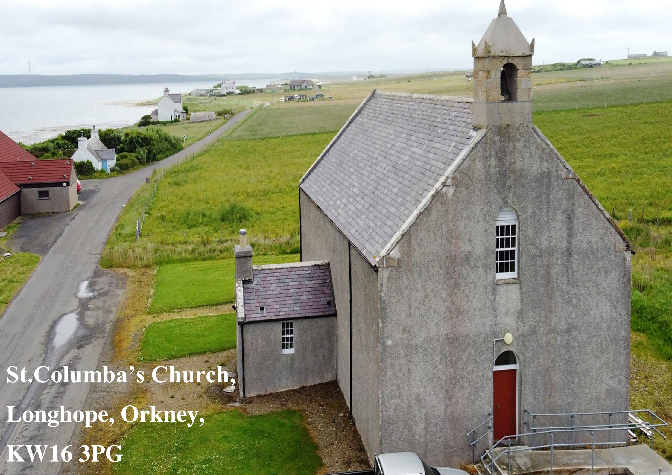
St.Columba's Church, Longhope, Orkney, KW16 3PG