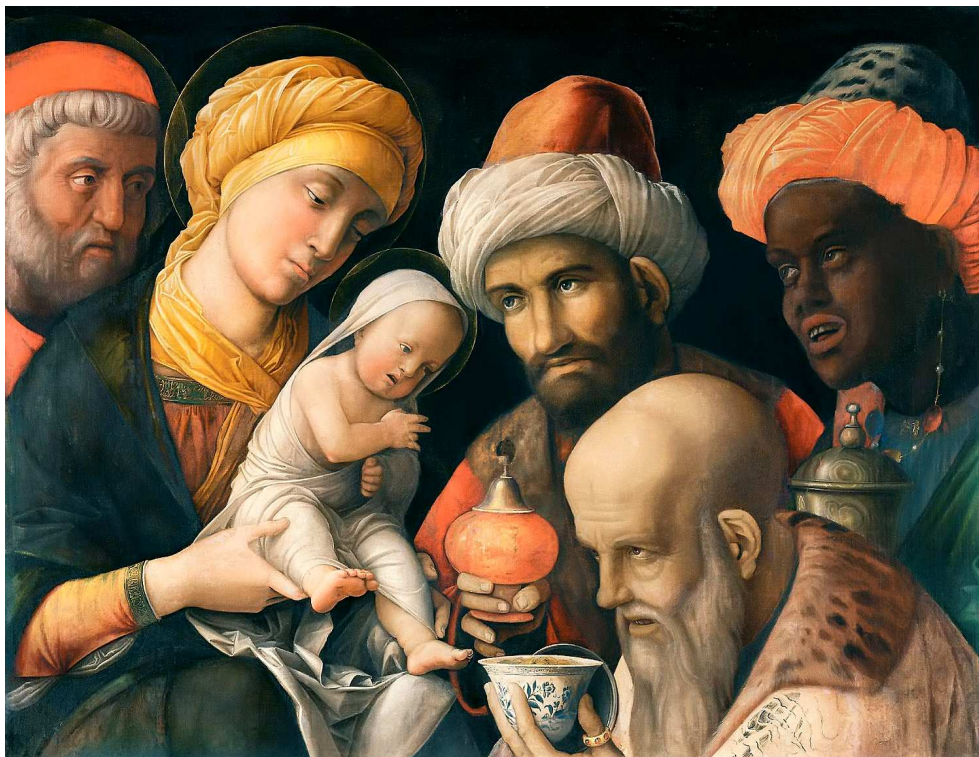
Adoration of the Magi – Andrea Mantegna c1500 1