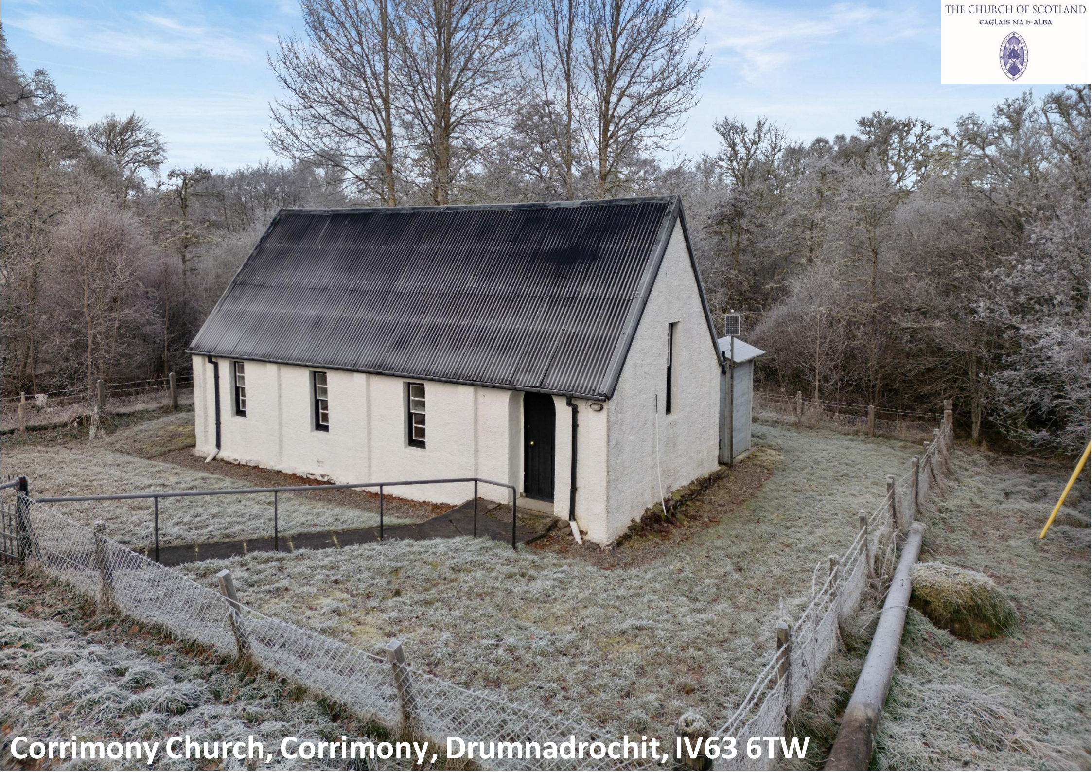
Corrimony Church, Corrimony, Drumnadrochit, IV63 6TW