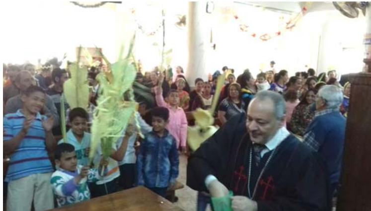
Palm Sunday in a church plant