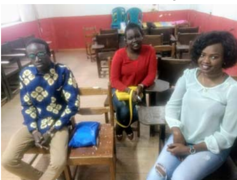
Dinka students learning English

My main news , however, is that I will be coming back to Scotland. I will travel back in the middle of May to attend the General Assembly and then to visit Sutherland and Shetland on deputation . It will be good to visit with you and share my experiences about Cairo and the Church in Egypt. I will also, however, be sharing some more personal news. Much of my time at ETSC is spent in an