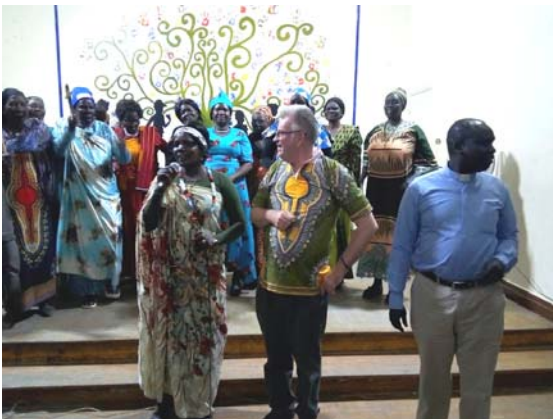
Presentation of my African shirt