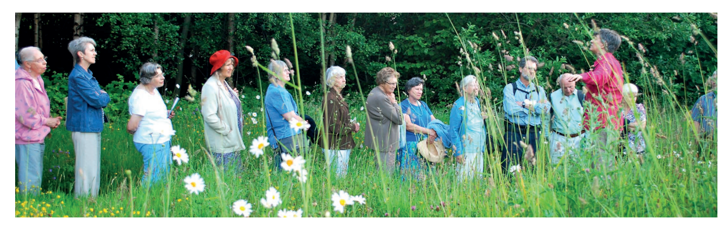
Eco-Congregation Scotland members at Midsummer Meeting in the Botanic Gardens, Edinburgh

In the twenty first century climate change will change lives around the world. The Church of Scotland wants congregations and others to have the skills and confidence to respond effectively to this challenge.