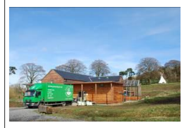
Whitmuir Farm, Scottish Borders

In contrast Whitmuir is a small upland farm of 140 acres in the Scottish Borders. The farm is a mixed operation like Drumness but much smaller in area and numbers of stock. The operation is organic and rather than selling to supermarkets sells directly to the consumer through a box service, a farm shop and restaurant, and a local supporters' scheme.